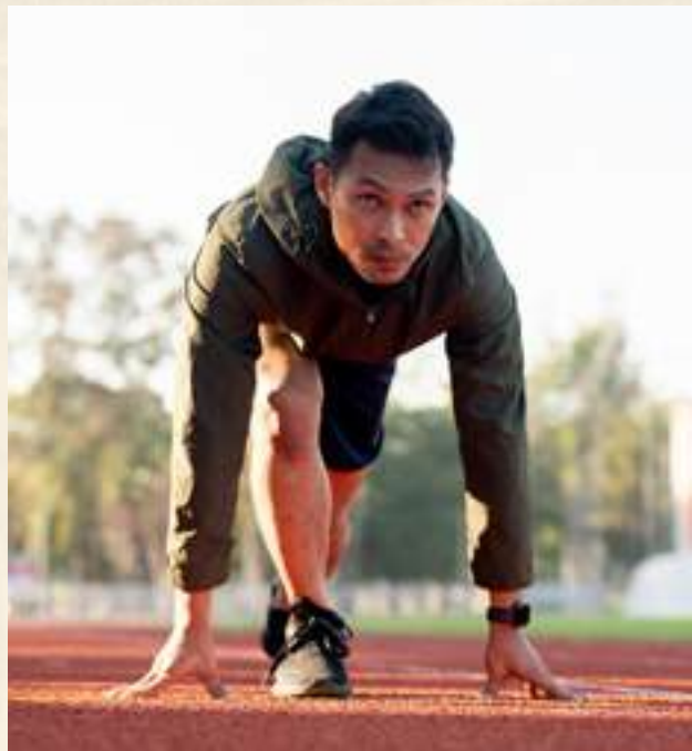
Running & Cycling Tracks