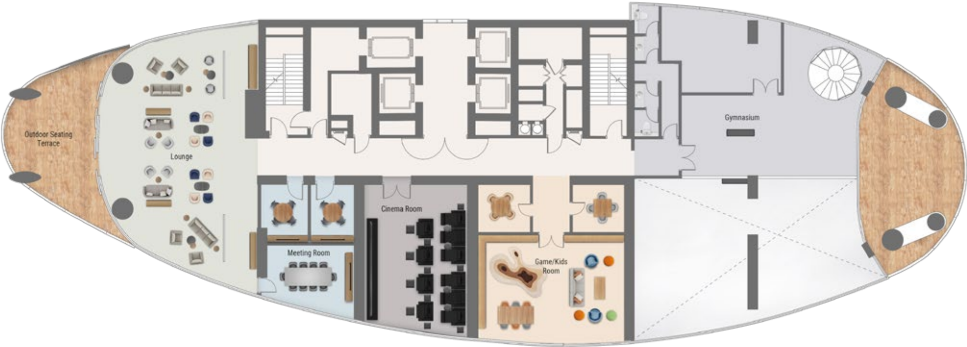
AMENITIES, PODIUM LEVEL 5