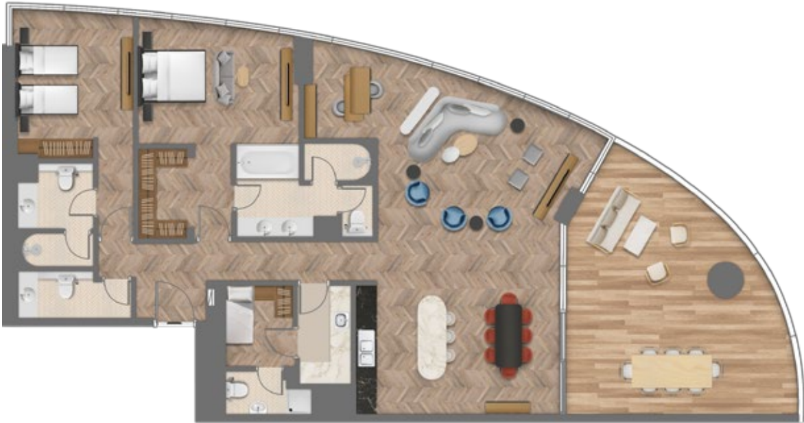
2 BEDROOM APARTMENT, TYPE A