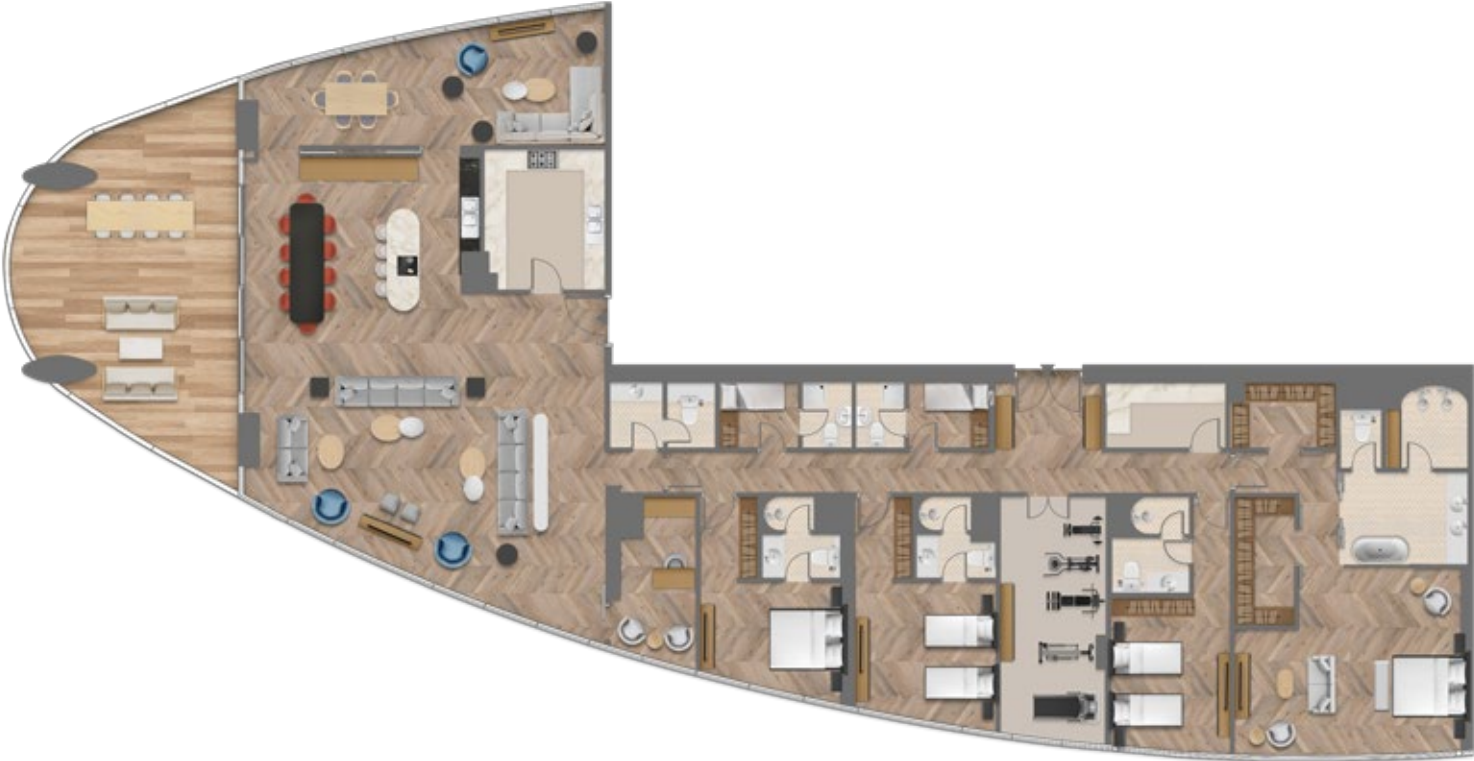
4 BEDROOM APARTMENT, SIMPLEX