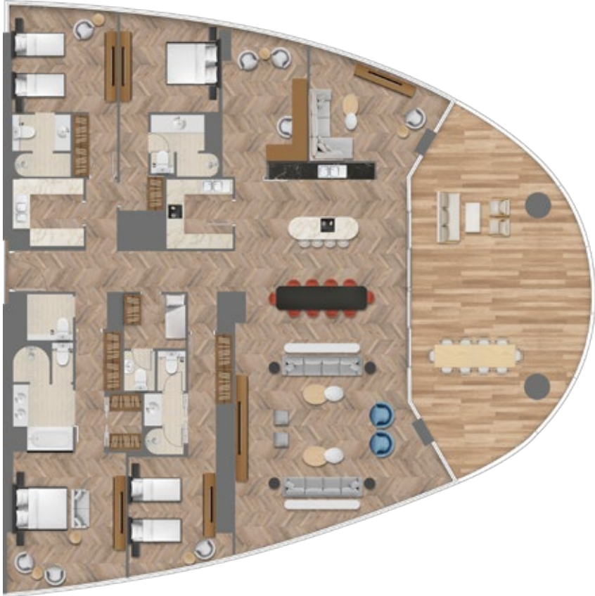
4 BEDROOM APARTMENT, TYPE A