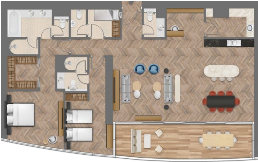
2 BEDROOM APARTMENT, TYPE C