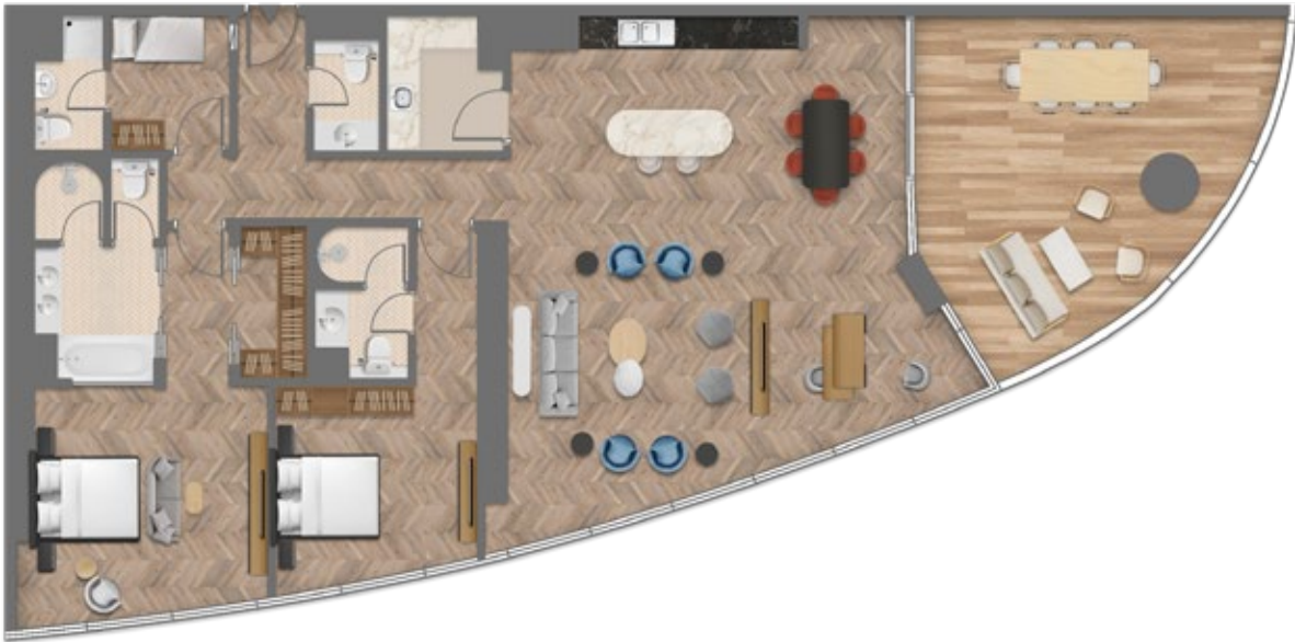
2 BEDROOM APARTMENT, TYPE B