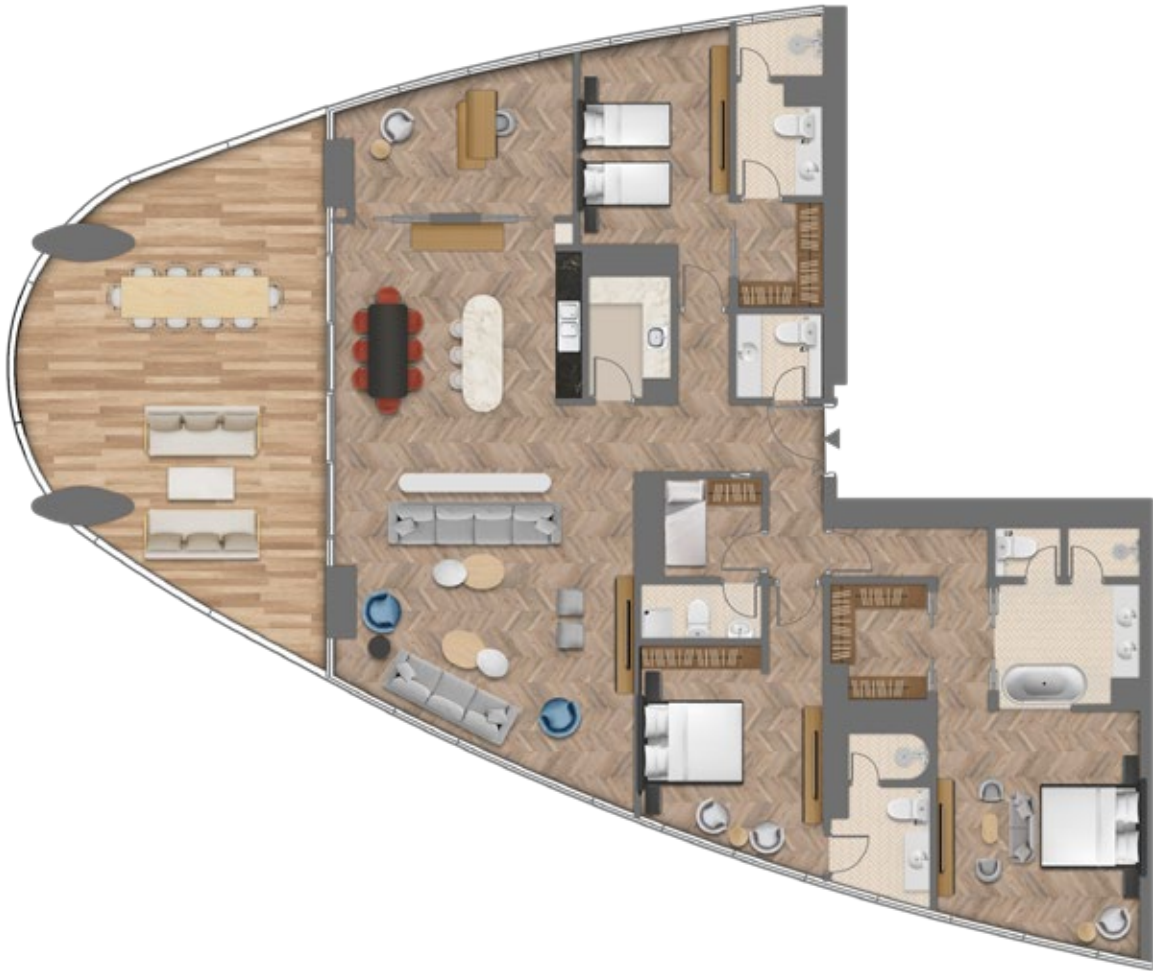
3 BEDROOM APARTMENT, TYPE A