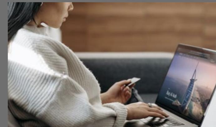
Pay with Points