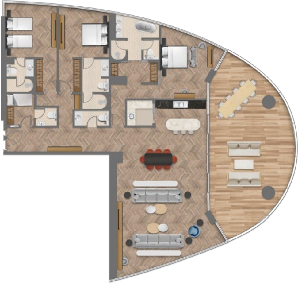
3 BEDROOM APARTMENT, TYPE B