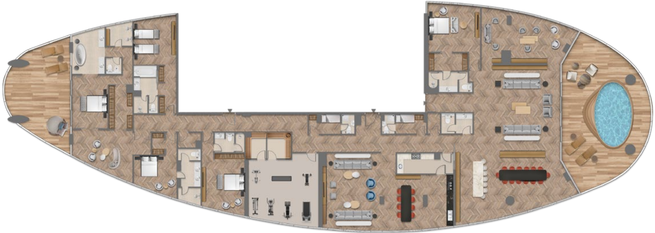
5 BEDROOM FULL FLOOR PENTHOUSE