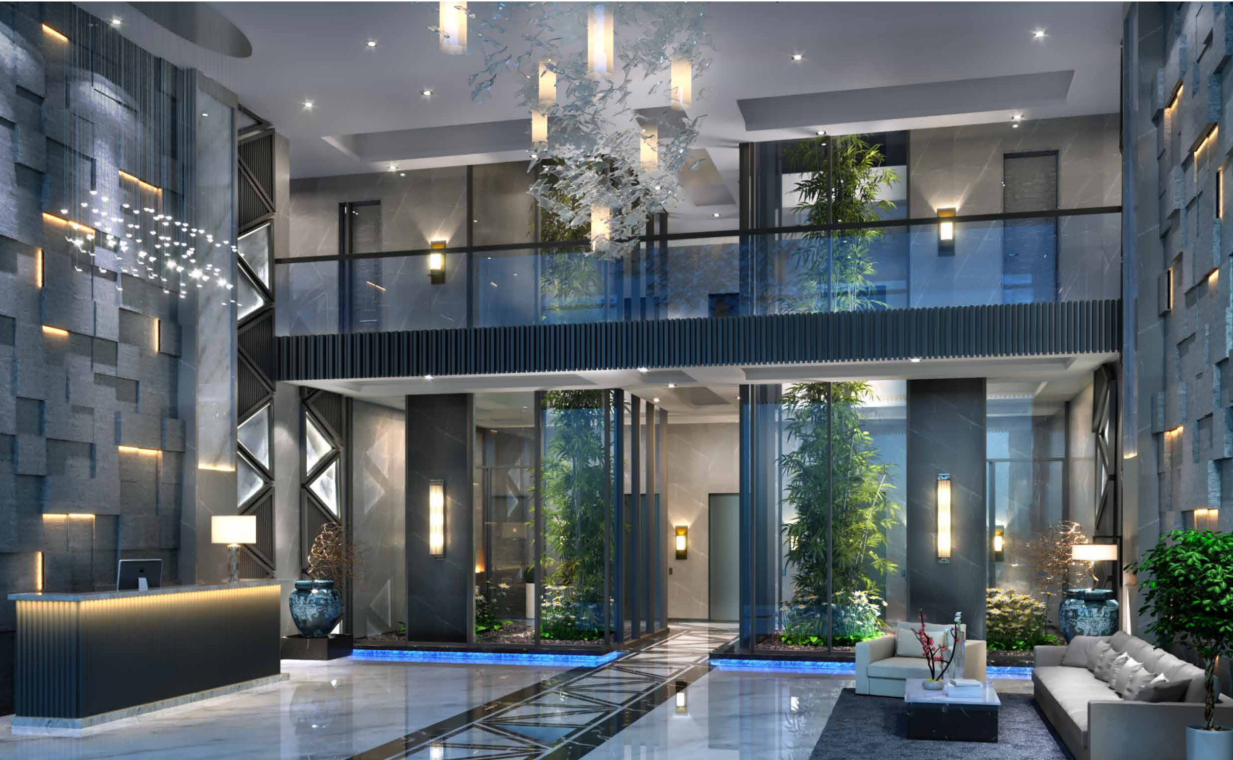
DOUBLE HEIGHT SPACIOUS LOBBY

The colossal lobby has been designed with aesthetic acumen to inspire awe in the viewer. To add the crowning touch to the magnificence are the vertical gardens emphasising the grandiosity and fresh awe a million times over.