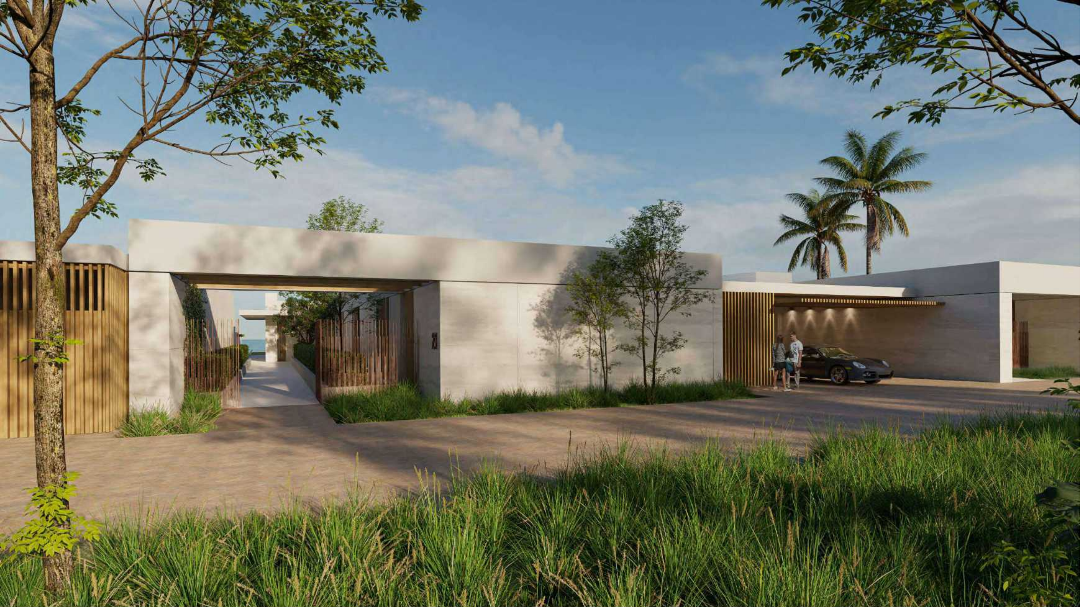
Planted verges alongside pedestrian-friendly roads lend a lush resort-style character to the beachfront community.