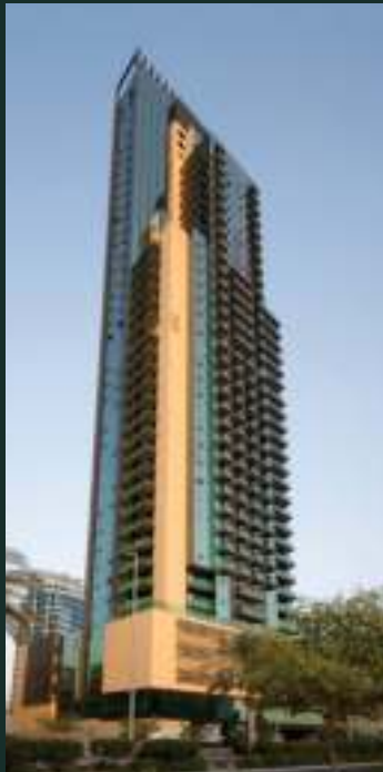
The Square Tower