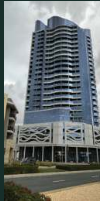
Blue Waves Tower